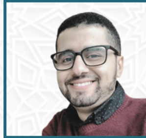
Imam Ebrahim Alareqi